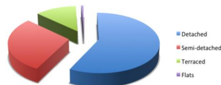
Figure 2: 2011 Breakdown of housing type