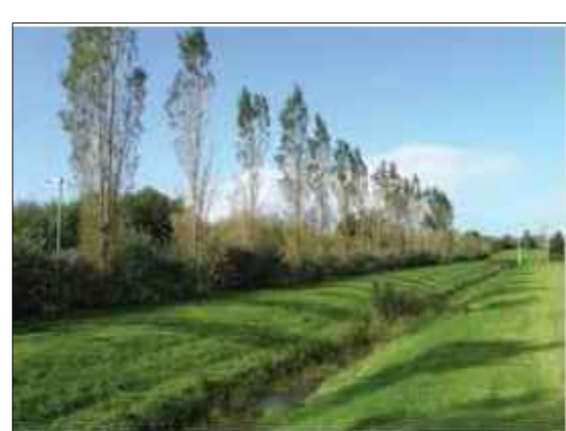
EXAMPLES OF SWALE LAYOUTS