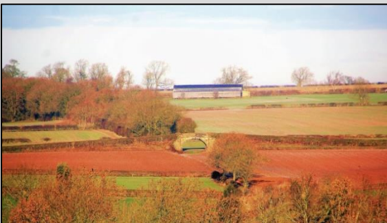
5b. From Mill Mound northwest across the upper Wycomb valley to the mineral railway and hill ground in the north of the parish.