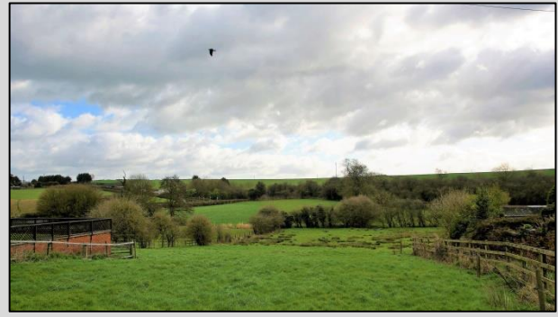
3. East from School Lane, Scalford, into rising, deeply rural open countryside. At night this viewpoint provides a 'dark sky' view for residents.