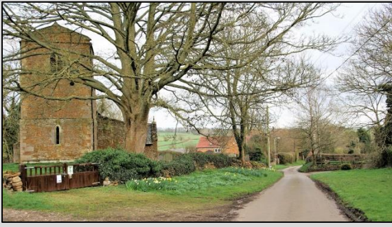
8. Village view in Chadwell southeast down the main street from the church and the wide verges at the village entrance (Local Green Space).