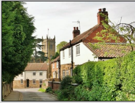
2. South down the slope of Sandy Lane, Scalford, from the recreation ground and allotments into the historic heart of the village including the church tower.