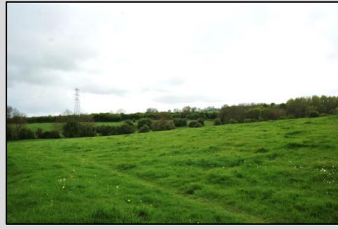
9. Southwest from the western edge of Scaford into the Scaford Brook valley and across to the high ground beyond.