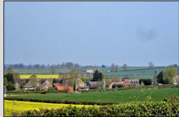
5a. From Mill Mound northeast to Wycomb village.