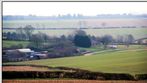
5c. From Mill Mound southeast across the long hillside toward the deserted medieval village.