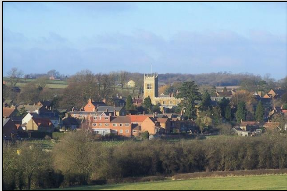
4. Northwest from Thorpe Side at Mill House Farm down footpath F23 to the mineral railway embankment and the south end of Scalford village.