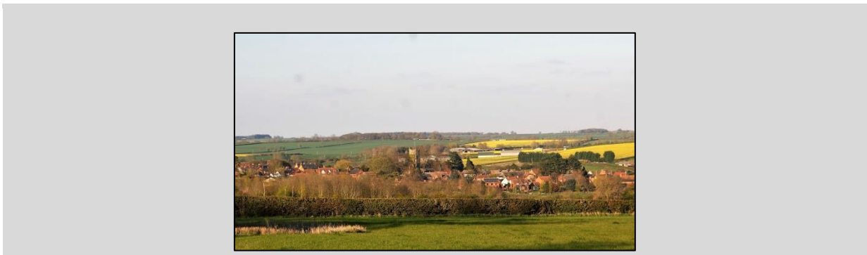
1. Northeast from the brink of the high ground on Melton Road over pastureland and the woodland along the line of the disused railway to Scalford village including the church. This is the gateway view for Scalford.