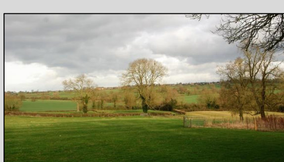
7. East from Chadwell churchyard (Local Green Space) over rural open countryside, hedged fields with standard trees.