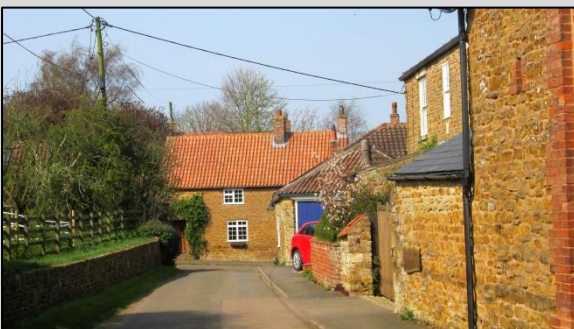
6. Village view in Wycomb west down Pickard's Lane.